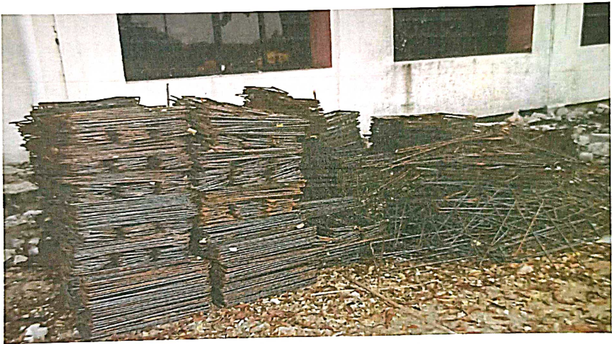
4.4.2 Maintenance Work (d)