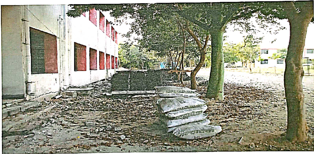
4.4.2 Maintenance Work (b)