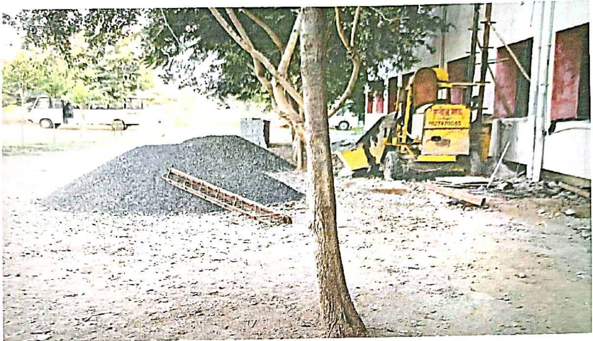
4.4.2 Maintenance Work (a)