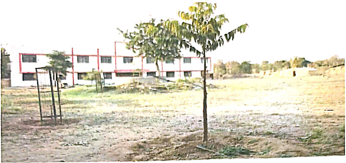
4.4.2 Maintenance Work (c)