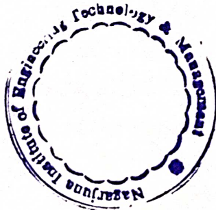
Principal Nagarjuna Institute of Engineering Technology & management

We have installed 20 KW p Solar Panel on the top roof of the college. This is used to supply the electricity to meet the lighting and lab related requirements of the various departments of our college. The bill of Solar installation is attached below, showing the unitwise consumption for various months throughout the year.